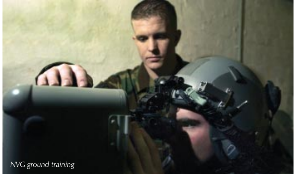
NVG ground training

A modified operation might entail raising the floor of the training exercise to allow the civilian aircraft to pass under safely. A suspended operation requires the military aircraft to hold until the civilian aircraft is clear of the area. In the event an exercise is terminated, also referred to as a “knock-it-off,” military pilots turn on their external lighting and discontinue the exercise.