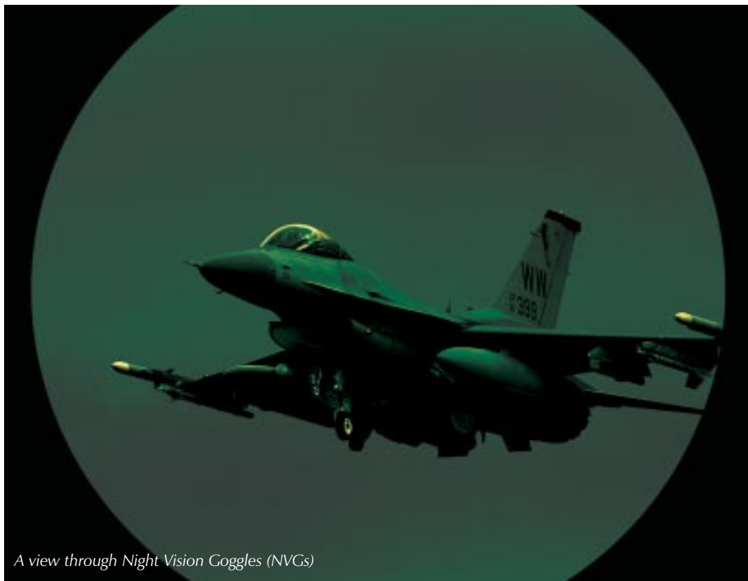
A view through Night Vision Goggles (NVGs)

Sample request to FSS: "Cessna 4329 Kilo on VFR flight plan to Centerville Airport at 7,500 feet, requesting current status for Volk MOA." Common phraseology is "hot" for active and "cold" for inactive, which succinctly describes the status.