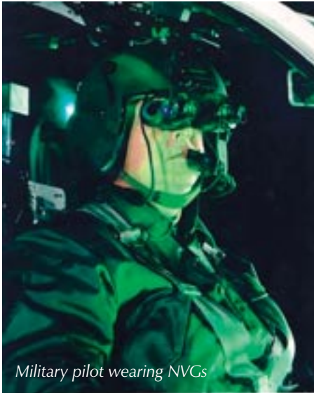
Military pilot wearing NVGs