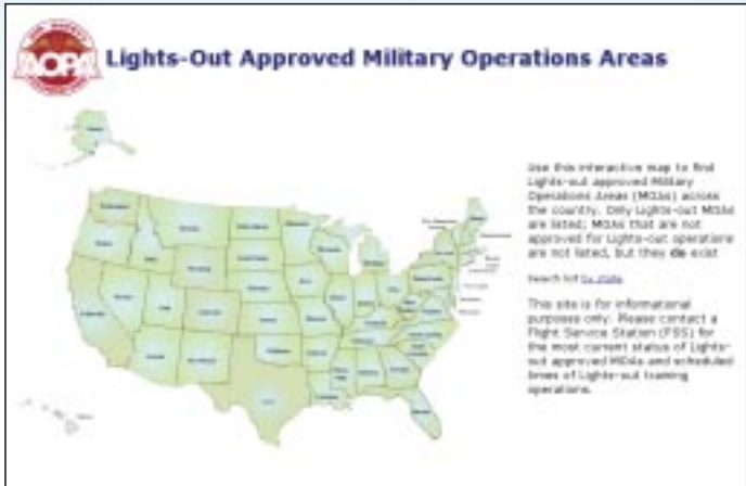
Figure 1: www.aopa.org/asf/publications/sa21_moa.html

Although this exemption may not appear to be in the best interest of safety, a number of safeguards have been implemented. The GA industry, including AOPA, worked tirelessly with the military and the FAA to reach an agreement allowing the military to train for vital missions while maintaining safe skies for everyone.