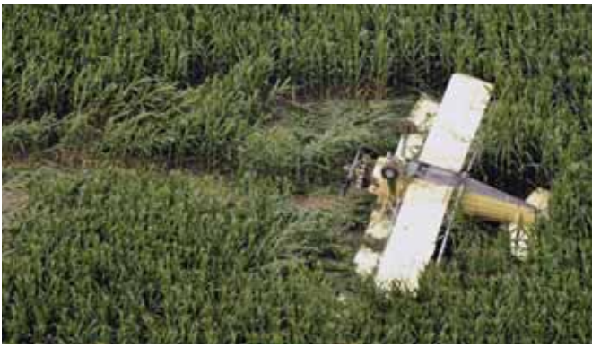
This crop duster came to grief after a forced landing in a cornfield. If possible, avoid fields with tall crops.