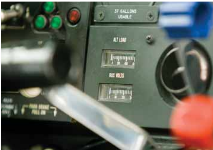
Some problems are easy to overlook.

Some problems are obvious. A broken crankshaft will make itself known immediately. But smaller, more insidious problems can be difficult to detect if you're not paying close attention. Deviations from the weather forecast can be quite subtle. Trouble with the aircraft—a failing electrical system, for example—can easily be overlooked.