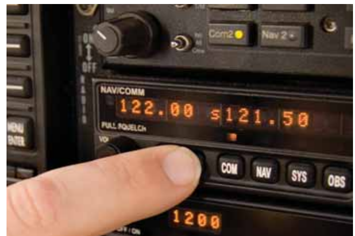
In a critical situation, help is as close as your radio.

Suppose that, despite good intentions, everything goes wrong and you're faced with a critical decision. The absolute, number one priority should be getting on the ground alive and unharmed . In some cases, that might mean making a precautionary off-airport landing, even if it involves damaging or destroying the aircraft. That's why we have aircraft insurance. Airplanes can be replaced—people cannot.