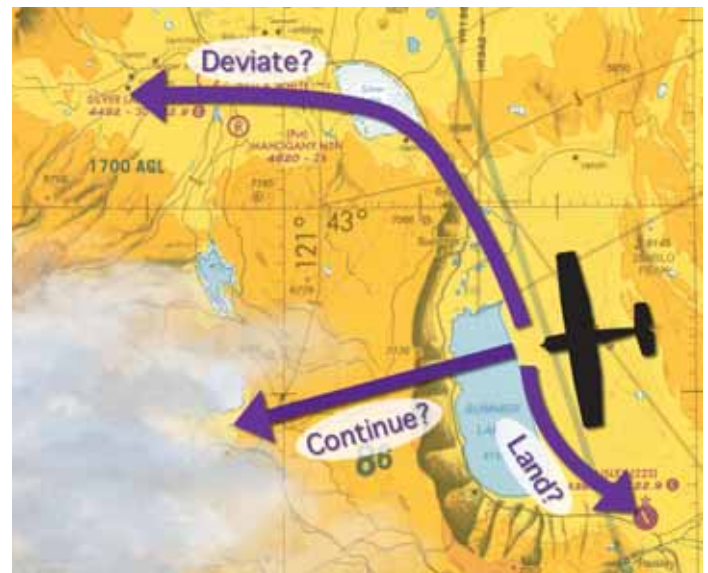
Basic options available when a problem arises.

At the risk of oversimplifying, the basic options available when a problem arises are as follows: 1) Continue the flight as planned, paying very close attention to whatever is causing the problem; 2) Continue the flight, deviating from the plan as necessary; or 3) Get the airplane on the ground as soon as practical.